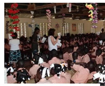
Right: Hand washing station & 600 children sing a hand washing song